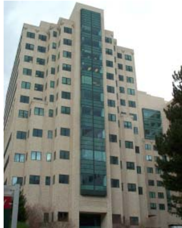
The Hatfield Research Center has developed folds in the building's façade that create vertical shadow lines. The design of the central bay window/transom panel combination creates a visually-prominent vertical focal point running almost the entire height of the building.