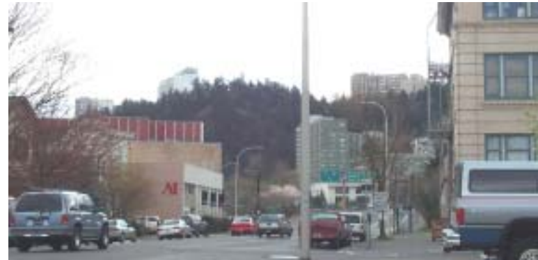
View from Downtown

The programmatic demands of a large institutional or medical building typically necessitate boxier building forms that often explicitly express the internal horizontal nature of the building on its exterior. Emphasizing a building's verticality, creating multiple building masses, and articulating visible facades are examples of design techniques that can support a building's internal functions while decreasing the visual prominence of large institutional development.